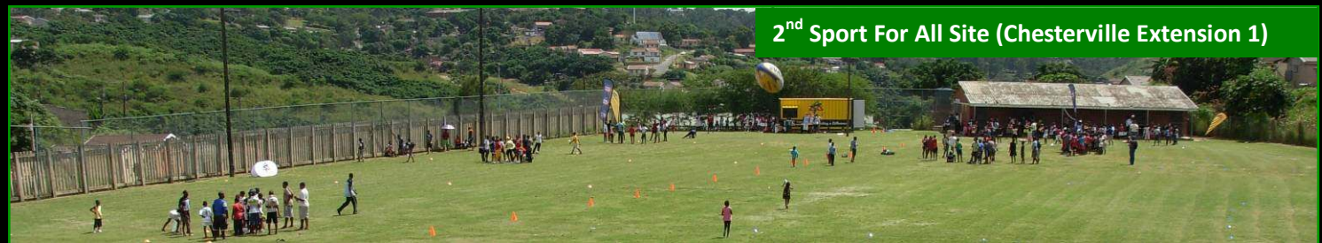
2 nd Sport For All Site (Chesterville Extension 1)