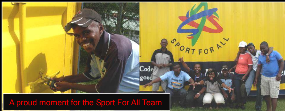
A proud moment for the Sport For All Team

We are very pleased to report that following the successful operation of Sport For All at Chesterville Sports Ground (Road 1) since early 2009, support from Sport For All Franchising has led to a second Sport For All franchise in Chesterville. The new site is in Chesterville Extension 1, on a municipal field located between H.P. Ngwenya Primary and Chesterville Extension Secondary Schools.