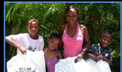
New school uniforms

We look forward to observing the progress of the bursary candidates, and trust that they will in time fulfil leadership roles in their families and community.