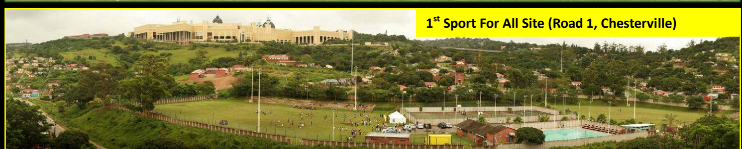
1 st Sport For All Site (Road 1, Chesterville)