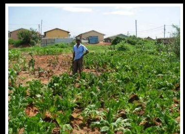
Masxha Garden Site

Investec has committed to invest in two gardening projects in Chesterville. With the assistance of the Chesterville Residents Association, suitable sites have been identified and on-site training, to be provided by Food & Trees for Africa, will commence in April. The investment package for each site includes a 2-day practical workshop, gardening equipment and planting materials (seeds, seedlings). The aim of the project is to help groups who are already taking initiative to create productive, sustainable gardening projects, which can be a source of food and income for community members; as well as a working model which others can learn from. Preparation of the sites (clearing of bush and weeds etc.) has started. Corporate 'work-parties' are invited to participate in this collaborative effort – current needs include the collection of free manure from Yellowood Park to assist with the improvement of soil condition.