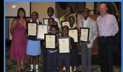
Suncoast Bursary Announcement