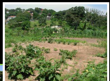
St. Ann's Catholic Church Site

Suncoast staff 'work-party' clearing weeds at the St Ann's site ▶