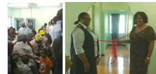
ARV Roll-Out Launch

The Forum has continued to run smoothly and has been meeting on a monthly basis. This year the Forum would like to focus more on collectively dealing with some of the cases and difficulties experienced by Forum members and ensure effective monitoring of referrals. Current active members are Vukukhanye, Highway Hospice, Muthande Society for the Aged, Noluthando Nutrition, Sivukile, Cato Manor ABM, Cato Manor Pastors Fraternal, Chesterville Clinic, Community Health Workers, EPWP Drug Awareness Counsellors, West City Fellowship, Olive Leaf Foundation and Zoë-Life.