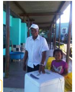
Washing machine donated to Siceluthando Educare Centre >>

SUNCOAST staff and Umzingi Contractors transported, repainted and restored a jungle gym donated by a Westville resident to the Bamba Izandla Preschool in Chesterville; where the school's 40 children previously had no playground equipment.