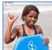
< Bodyboarding Clinic