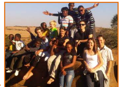
Tala Game Reserve >