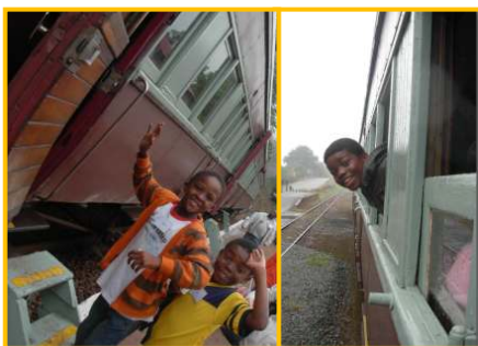
< Inchanga Choo-Choo