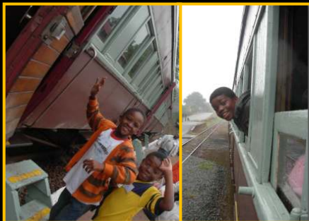
< Inchanga Choo-Choo