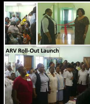
ARV Roll-Out Launch

The Forum was actively involved in assisting the Chesterville Clinic with the launch of the ARV Roll Out in March 2011 i.e. ARV's as well as pre-and post-test counseling are now being provided (to new patients) from the Chesterville Municipal Clinic. The event was a great success thanks to excellent cooperation and partnership between all stakeholders.