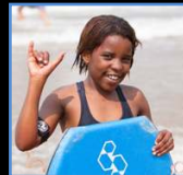
< Bodyboarding Clinic