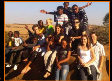
Tala Game Reserve >