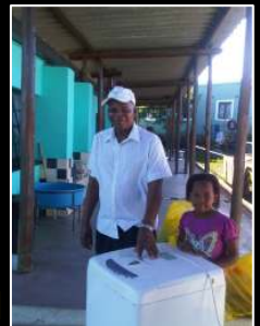
Washing machine donated to Sicheluthando Educare Centre >>

SUNCOAST staff and Umzingi Contractors transported, repainted and restored a jungle gym donated by a Westville resident to the Bamba Izandla Preschool in Chesterville; where the school's 40 children previously had no playground equipment.