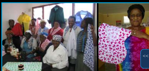
<< Phambili Siyakhana Sewing Group with some of the 316 donated bandanas and one of the items created for sale.