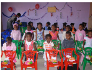
Bamba Izandla Preschool Christmas Party & Graduation.

Vukukhanye has a long association with the Bamba Izandla Preschool and other preschools in Chesterville and is presently facilitating the establishment of a preschool network of six schools. The primary goals are the training of staff, equipping the schools for creative play and learning, and facilitating adequate resources for curriculum development. A recent information sharing morning at Berea Primary School was very successful and more of such partnerships between established schools and the Chesterville preschools will be facilitated.