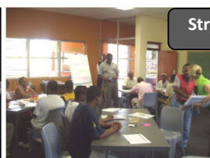
Street Committee Facilitator Training & Training Materials