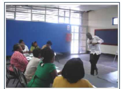
Community worker training

Since October 2008, ten community workers have been conducting home-visits, completing family contact forms and identifying the issues that families are facing. While this information is being used to create a database of social needs, the community workers and social worker have also provided direct intervention and follow up. This has included cases of child abuse and neglect, child-headed households, referrals to Home Affairs, assistance with foster care grant applications, as well as facilitating all children of school going age being registered and attending school, and motivation for the waiving of school fees when appropriate. The community workers have received training on counselling of children, food security, types of grants available and requirements needed to access them. Health-related issues are referred to the Highway Hospice or other appropriate organizations.