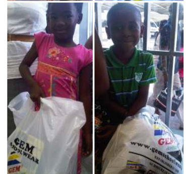
School children with new uniforms!