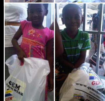
School children with new uniforms!