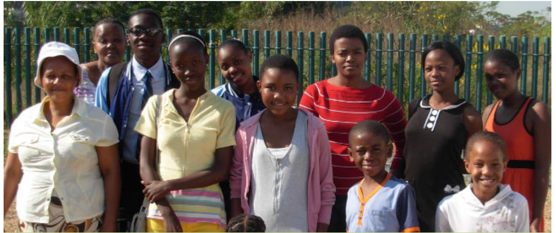
Some of the bursars, along with their parents at a bursary feedback meeting.

"without substantial numbers of university-trained professionals a country cannot advance. No educational factor correlates as strongly with gross national income as does university enrolment." (Mayer, 2007)