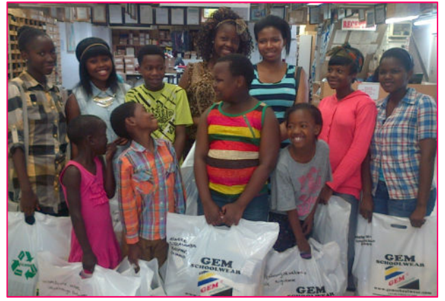
Most of the school bursars with their school uniforms, ready for 2014