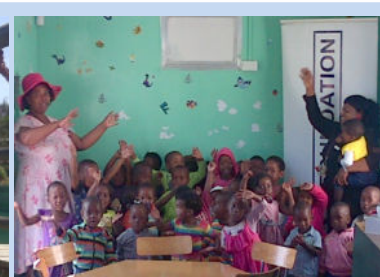
A welcome visit and support from the Key Foundation