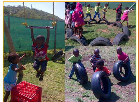
"Play is the work of children". Some of the children at the jungle-gym area