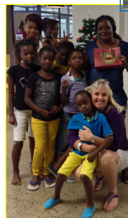
Christmas party with FMI