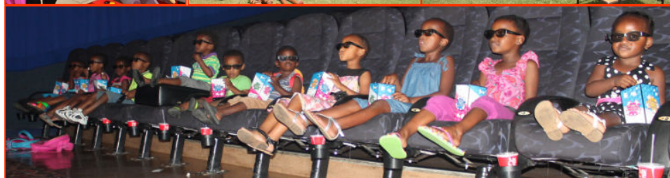
◀ 21 children having a wonderful time with Suncoast staff – 'Smurfs 3D', games and relaxing in the sun