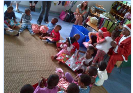
Christmas Party, thanks to 'Fins & Flippers Swimming School'

The Vukukhanye Educare Centre has now been at its new home, on the property of uKukhanya Kwelanga Junior Primary School in Chesterville, for one year. The set-up process has been ongoing with some encouraging progress in the last few months, thanks to generous support – the toilet and kitchen units have been fully plumbed and connected to the sewer and water mains (including a gas geyser to supply warm water to the kitchen); the two large rainwater tanks connected with a pump to a garden tap; a large area of instant lawn laid and the jungle gym installed. We are still working towards electricity connection.