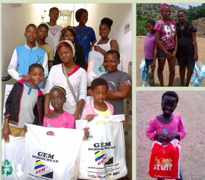
School bursars with stationery and uniforms