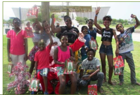
Christmas party at People's Park