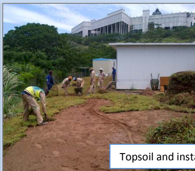
Topsoil and instant lawn