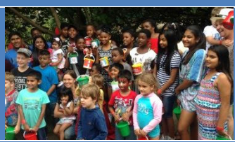
CHRISTMAS PARTY WITH FMI AT USHAKA KIDS WORLD (20 NOVEMBER 2016)