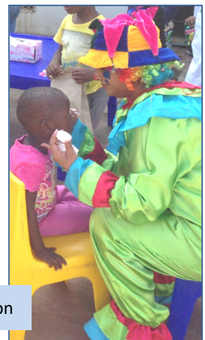
Fun with The Key Foundation

Drama Dynamics performed a play for the children; to which children from the nearby Shekinah Crèche were also invited.