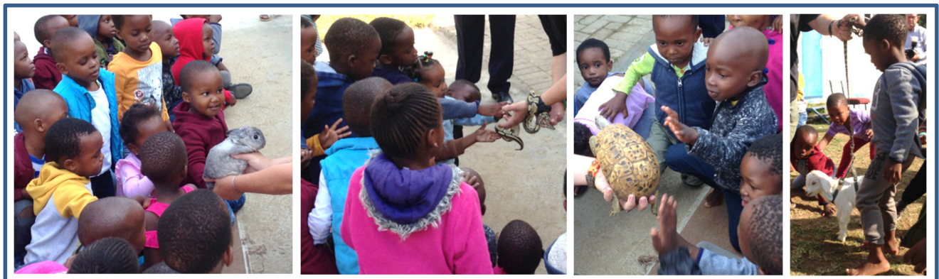
'The Menagerie' at the Vukukhanye Educare Centre.

Key Truck & Car arranged for a visit from a company (The Menagerie) which teaches children about animals by bringing animals to the school for the children to interact with. This was a tremendous learning experience for the children, who had the opportunity to see, touch and learn about a variety of animals; many of which they would never have seen before e.g. owls, bats, snakes, lambs, lizards, geckos and rabbits.