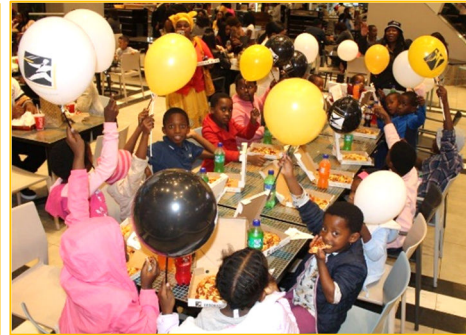
Children from Chesterville treated to pizza and a live Peppa Pig Show at Suncoast