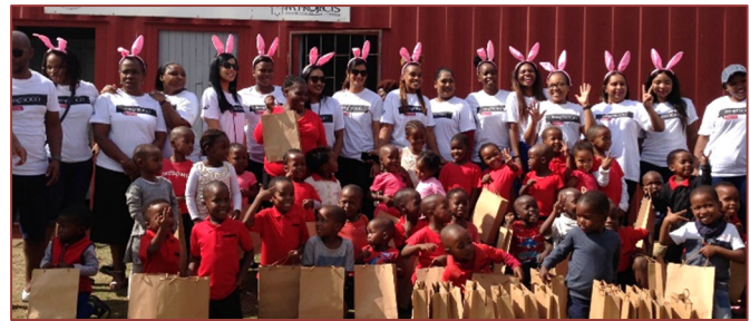
Suncoast Easter party, Easter-egg hunt and gift-packs for the children at Inami Preschool in Cato Manor