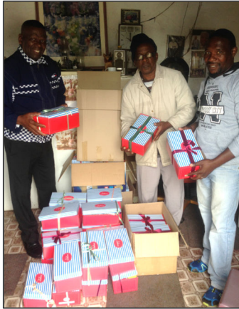
Christmas gift-packs for elderly clients of the Mhlangeni Society for the Aged, Chesterville

Suncoast continued to support community projects in Chesterville through regular CUP (“Community Upliftment Project”) visits and other interventions, such as the Peppa-Pig outing mentioned below... These visits have been a tremendous benefit to those concerned and are a great encouragement to the community.