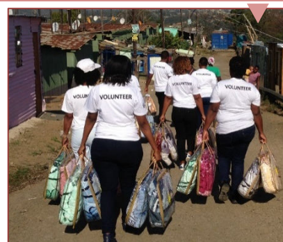
Suncoast staff distributing blankets on Mandela Day

Volunteers are critical to the operation of all projects and assist with tasks such as transport, collection of donations, medical supervision and care, homework and school support, repairs and maintenance, counselling, entertainment, child-minding, corporate or church 'work-parties', housework help, outings for the children and the provision of resources.