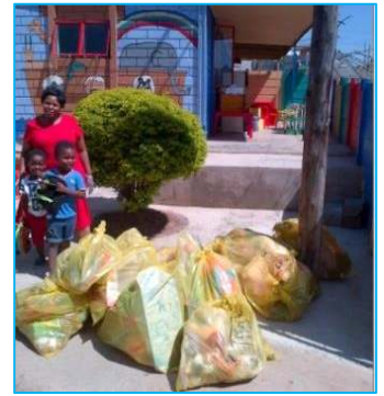
Westville Rotary donated toys to Vukukhanye for distribution to crèches (part of the East Coast Radio Toy Story Campaign ).

Vukukhanye has continued to facilitate support where possible for seven preschools in the Chesterville area. The schools are Bamba Izandla, Siceluthando Educare Centre, Ekuthuleni Educare Centre, Mazenod, Zamokuhle, Khulakahle and Inami Crèches. Cygnet Preparatory School also hosted periodic workshops to help equip the principals and teachers with education and management ideas, techniques, resources and tools.