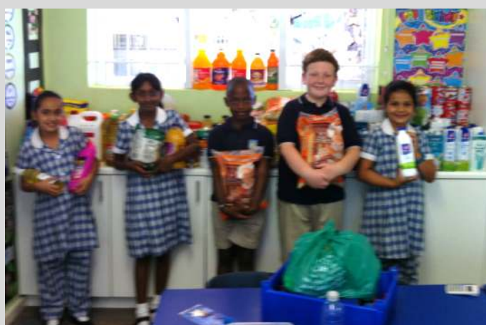
Food collection from Cygnet Preparatory School