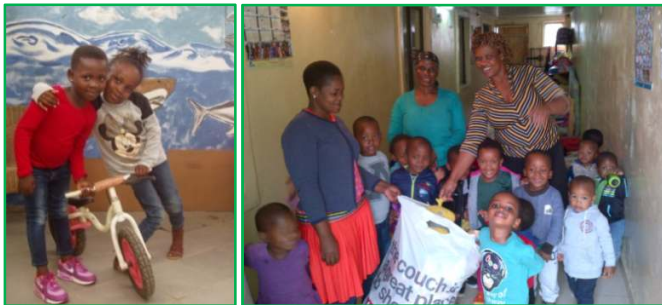
Second-hand toy donations passed on to crèches

Vukukhanye’s partnership with Suncoast includes monthly staff CUP (“Community Upliftment Project”) Visits, which often include visits to and support of Chesterville preschools. This included an Easter visit to Inami Crèche (Easter Egg decorating), the donation of a new stove and fridge to Inami Crèche, a donation of 67 brand-new children’s books to the Vukukhanye Educare Centre (for Mandela Day), transporting 200 children from these crèches to the Dino’s Alive dinosaur expo at Suncoast, and treating the children at Kulakahle Crèche to a Christmas Party.