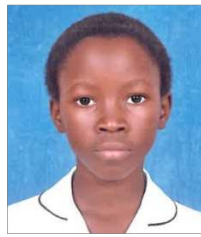
11. Sipiwo (12)