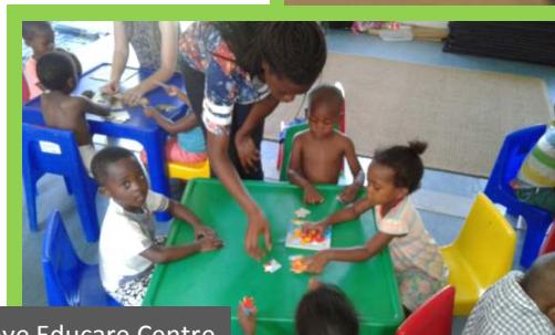
Zoë-Life volunteers at Vukukhanye Educare Centre