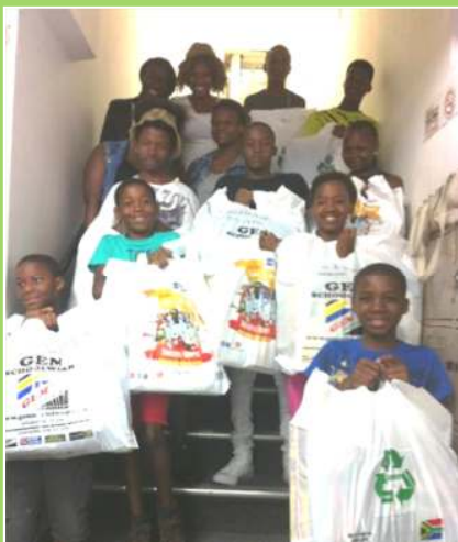
2016 school uniform and stationery shopping

While learners at Chesterville Schools are provided with text books by their school, they are generally not allowed to take them home. Vukukhanye is assisting bursars by buying textbooks, particularly for subjects with which they are struggling. The learners can then use the books at home for homework and self-study. The textbooks are then returned to Vukukhanye at the end of the year and made available to subsequent bursars as needed.