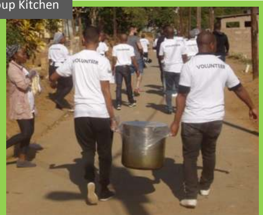
Mandela Day Soup Kitchen

Volunteers from local schools or tertiary institutions often assist when they are required to perform 'community service' as part of their annual coursework. Two French volunteers lived and worked at the Home for a month.