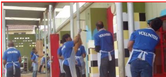
Painting Ekuthuleni Crèche, in Chesterville Ext. 1

Vukukhanye’s partnership with Suncoast includes monthly staff CUP (“Community Upliftment Project”) Visits, which often include visits to and support of Chesterville preschools. This included an Easter visit to Inami Crèche (Easter Egg decorating), the donation of a new stove and fridge to Inami Crèche, a donation of 67 brand-new children’s books to the Vukukhanye Educare Centre (for Mandela Day), transporting 200 children from these crèches to the Dino’s Alive dinosaur expo at Suncoast, and treating the children at Kulakahle Crèche to a Christmas Party.