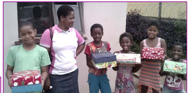
Christmas gifts from The Round Table of Durban North

Makhosi attends training as often as possible, and was enrolled in two training courses through Lifeline in 2015 i.e. a general counselling course (Personal Growth) and a Basic HIV/AIDS Counselling Course.