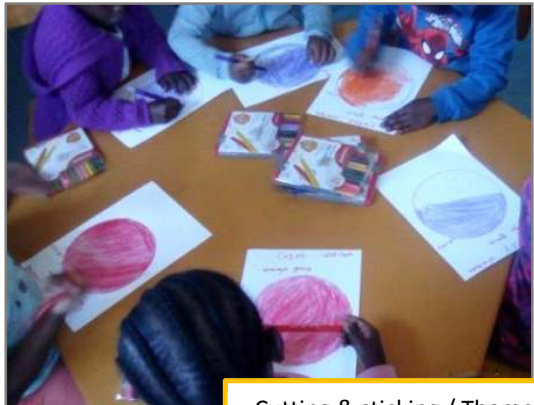
Cutting & sticking / Themes