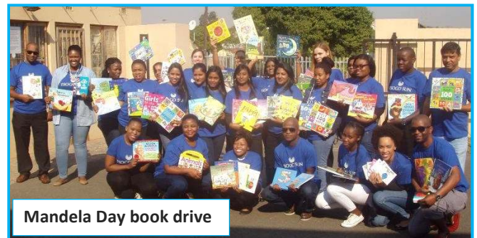
Mandela Day book drive