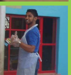
Suncoast painting Ekuthuleni Crèche