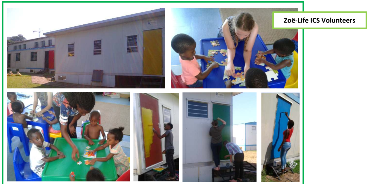
Zoë-Life ICS Volunteers

We are very grateful to Zoë-Life for partnering with us through the placement of volunteers as part of the International Citizenship Programme (ICS) i.e. the United Kingdom's global volunteering programme for young people aged 18-25 who want to do voluntary development work abroad, who are placed in teams with local volunteers.