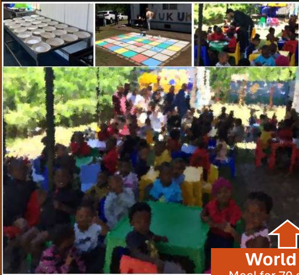
World Food Day Meal for 70 children provided by Vector Logistics

Thanks to partnership with The Starfish Foundation, 49 children were provided with new school shoes, as well as socks & stationery.